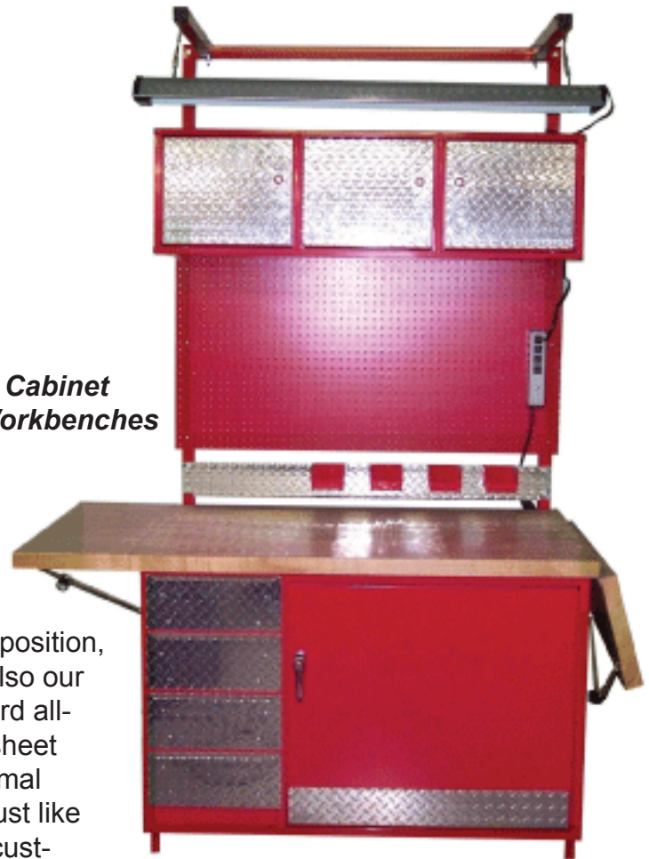
DTC4D14V97 with options: DL97 (2), OLF48, DTBR48, PEG24, PS4, DTL144, DTSL4

Available in our five standard color options, Beige, Black, Blue, Gray & Red. Top options are Wood Composition, Laminate (standard HPL), Maple Butcher Block and also our Diamond Plate digital laminate (printed HPL). Standard all-welded construction, tubular steel framework, heavy sheet steel panels and minimal assembly required - just like we've provided your customers for years!